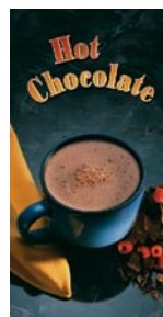
Model FMD-1 available with optional Hot Chocolate Display