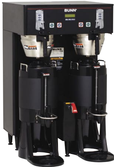
Model Dual TF DBC with 1.5 gallon TF Servers (servers sold separately) Dimensions: 35.7" H x 21.8" W x 20.2" D (90.7cm H x 55.4cm W x 51.3cm D)