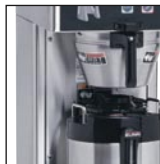
Stainless steel finish available.

Dimensions: 35.7" H x 12.1" W x 19.2" D (90.7cm H x 30.7cm W x 48.8cm D)