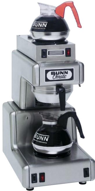
Model OL (2 warmers)