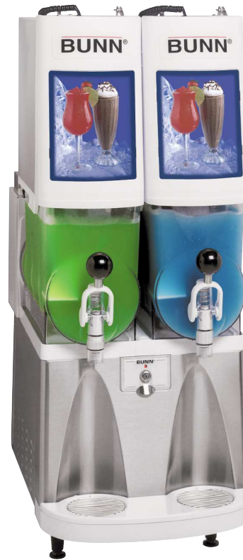
Model CDS-2 PAF*

* International models may vary in appearance.