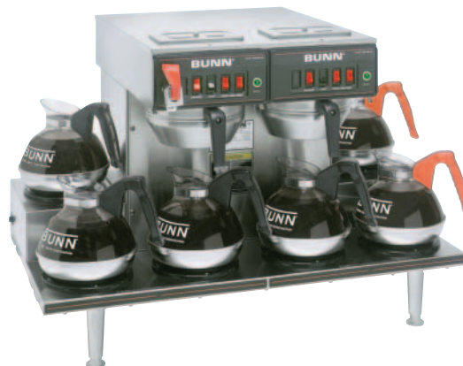
Model CWTF 0/6 Twin (decanters not included)