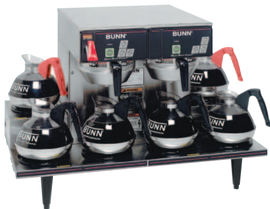
Model CDBC 0/6 Twin (decanters not included)