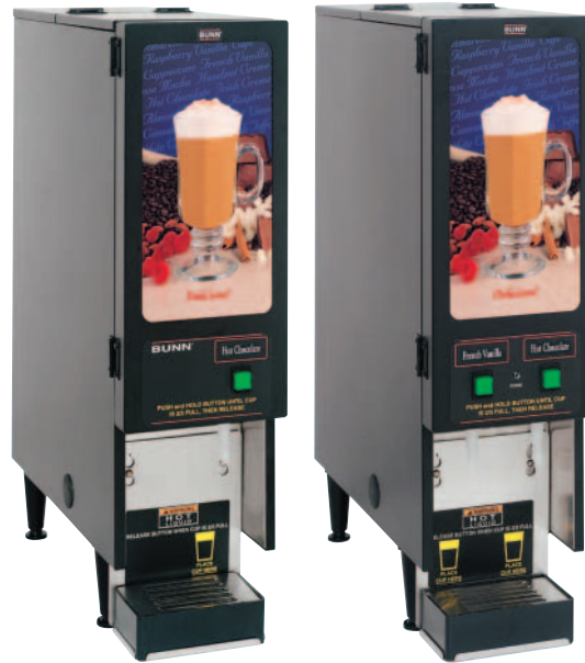
Models FMD-1 & FMD-2 Dimensions: 30"H x 7.9"W x 21"D