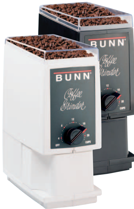
Model BCG-W and BCG-B